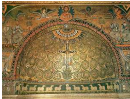
The True Vine, Basilica of St. Clement, Rome

How wonderful this weekend our eleven First Reconciliation and First Communion students are on retreat beginning with the 9:00 am Mass AND along with their families will witness the celebration the Sacrament of Confirmation for our seven high school students. Such an abundance of grace in one Mass! Today's Gospel reading of the Parable of the True Vine is the new way these younger students have come to know Jesus over the last few months of their sacramental preparation. It expands on last week's Gospel of the Good Shepherd who loves them and cares for them, who protects them and guides them, who calls them by name and they in turn follow the One who knows them. We had much more to learn in our covenant relationship with Jesus who now prepares us for fruitfulness—our work with God in building the kingdom.