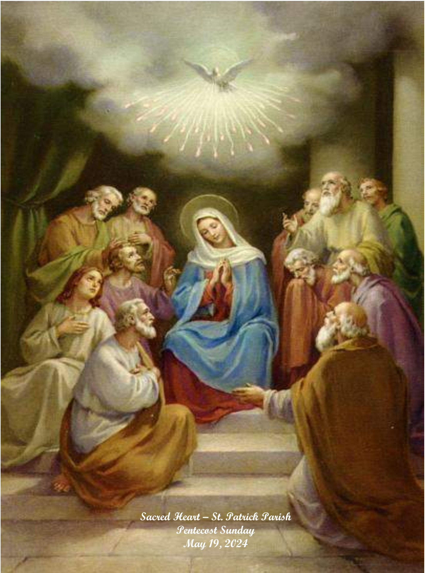
Sacred Heart – St. Patrick Parish Pentecost Sunday May 19, 2024