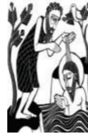
Herald of Jesus Christ, the Messiah & Lord