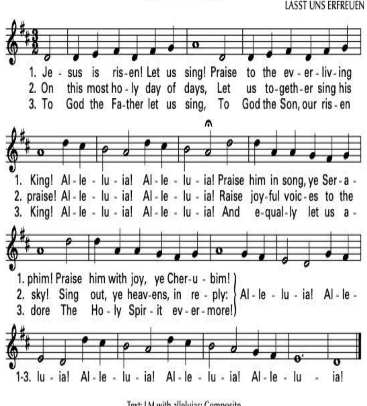
Text: LM with alleluias; Composite. Music: Auserlesene, Catholische, Geistliche Kirchengesänge, Cologne, 1623.