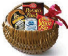
Table of Plenty Food Pantry

Table of Plenty Food Pantry will be providing Christmas Meal Baskets on Saturday, December 22 to the families registered with us for food assistance. In an effort to help meet each family's needs during this Christmas season, we are distributing after all Masses this weekend a "Meal Coupon" asking for your help in making this possible. Table of Plenty invites you to participate by providing the items requested on the "Meal Coupon" and returning them in the bag provided to Annunciation Church next weekend (Saturday and Sunday, December 15 and 16) when you arrive to attend Mass. We, and the families we assist, greatly appreciate your generosity. God bless you for the compassion in your hearts to help those in need.