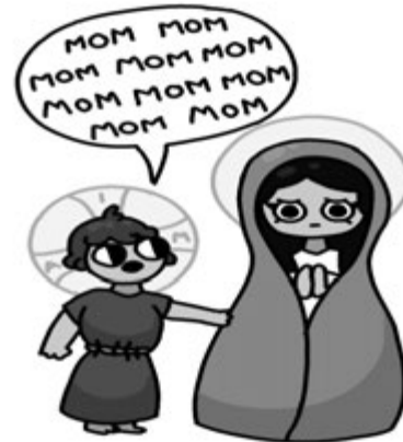
The First Rosary