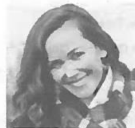
St. Mary of Mount Carmel Youth Director

For registration materials or more information call (609) 652-7729, e-mail: support@camdencharismatic.org Registration forms and on-line ticketing available at http://www.camdencharismatic.org