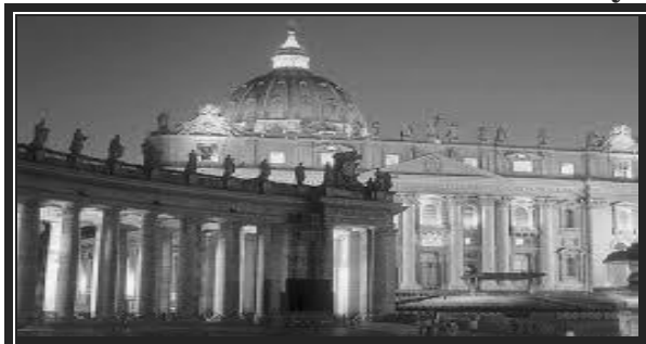
All Are Welcome to Join Us!