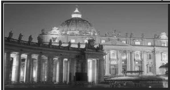
All Are Welcome to Join Us!