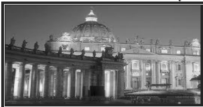
All Are Welcome to Join Us!