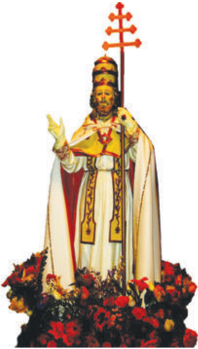
Pope Saint Leo the Great