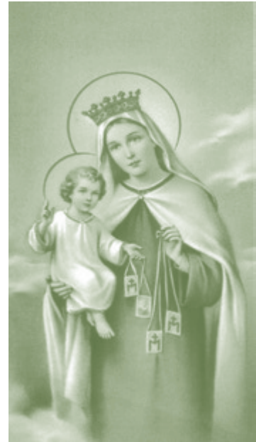
Our Lady of Mt. Carmel

If you are visiting our parish, we extend a warm welcome. Please feel free to introduce yourself to the celebrant. If we can be of service to you in any way, please let us know. We look forward to seeing you again.