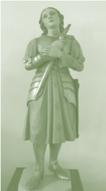
St. Joan of Arc