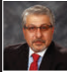
Member of Knights Of Columbus

Complete Auto Tag & Licensing Services PennDOT Authorized Service Center On-line Messenger 729 Ridge Road • Sellersville T 215-453-1417 F 215-453-1870 bfastautotags.com