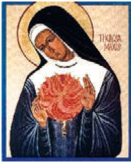
“Mother Theresa Maxis The Holder of the Fire”