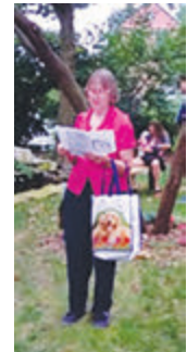
Blessing of the Animals last weekend