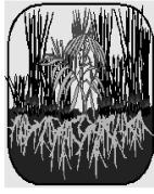
The Weedy Soil