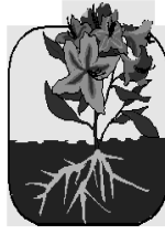
The Good Soil