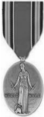
WORLD WAR II