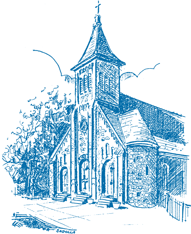
ST. MARK PARISH SITE

THE ROMAN CATHOLIC COMMUNITY OF HISTORIC BRISTOL BOROUGH WELCOMES YOU.