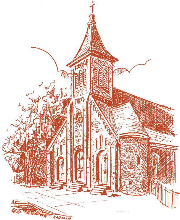
ST. MARK PARISH SITE

THE ROMAN CATHOLIC COMMUNITY OF HISTORIC BRISTOL BOROUGH WELCOMES YOU.