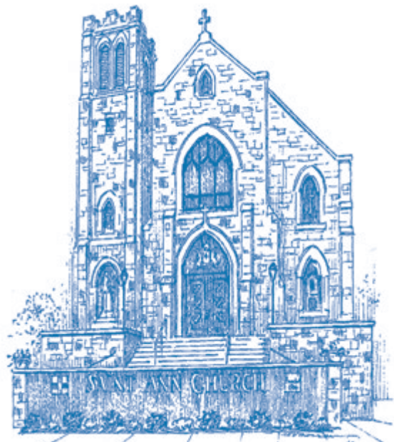
ST. ANN WORSHIP SITE

ST. MARK RECTORY: 215-788-2493 ST. MARK PARISH OFFICE: 215-788-2319 ST. MARK SCHOOL: 215-785-0973