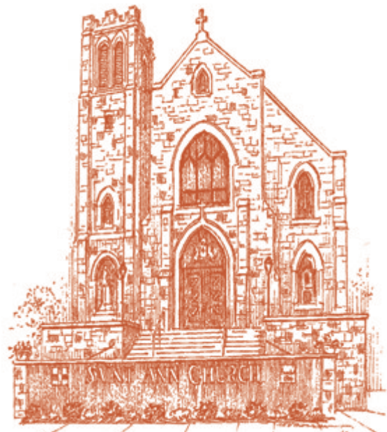
ST. ANN WORSHIP SITE

ST. MARK RECTORY: 215-788-2493 ST. MARK PARISH OFFICE: 215-788-2319 ST. MARK SCHOOL: 215-785-0973