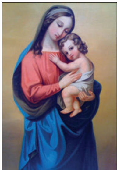
Our Lady of Charity, Pray for Us