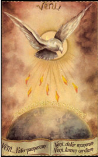
Come and Renew the Face of the Earth