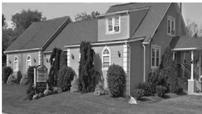
Saint Patrick Church, Norristown, PA Page 3 – 089