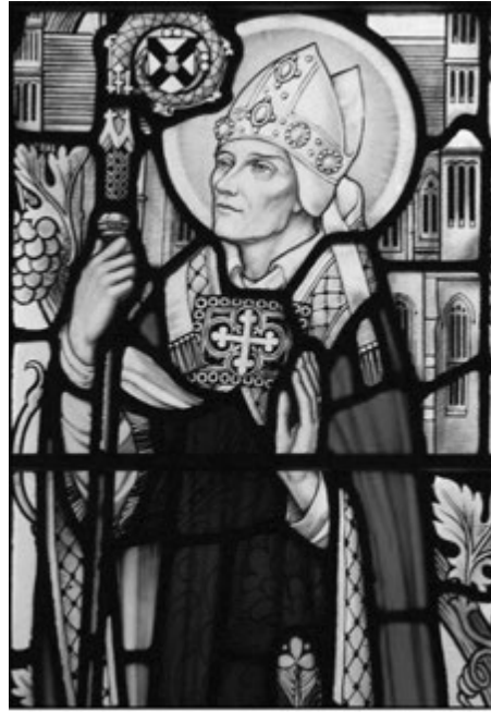
© Peter Catholic Church, Patuxent, Suffolk, VA. Photo by Simon D.

Mon – Thursday: 8:30 AM to 4:30 PM Friday: 8:30 AM to 1:30 PM ( Summer ) Saturday: 10:00 AM to 1:00 PM Sunday: 9:00 AM to 1:00 PM ( Office closed weekdays from 12:00-1:00pm for lunch )