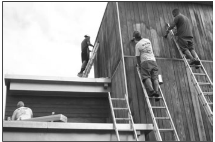
A crew from Top to Bottom Painting and Renovations spent hours cleaning and staining the exterior of the Parish Center.

This event is an opportunity for us to support our neighbors at Memorial Presbyterian Church as they rebuild after the fire that destroyed their historic Church building. Please join our neighbors for an evening of fellowship.