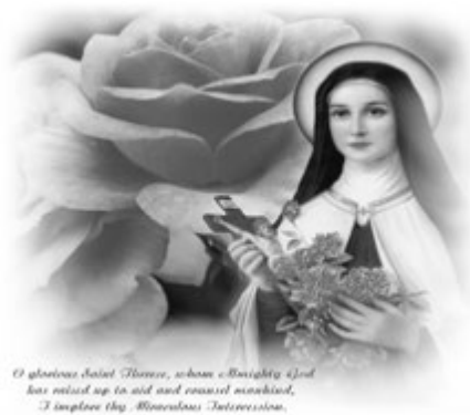
O glorious saint Therese, whom Almighty God has raised up to aid and counsel mankind, I implore thy Blessed Intercession.