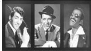
Rat Pack Flashback The Music of Dino, Frank, & Sammy