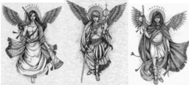
Archangel Gabriel - Archangel Michael—Archangel Raphael