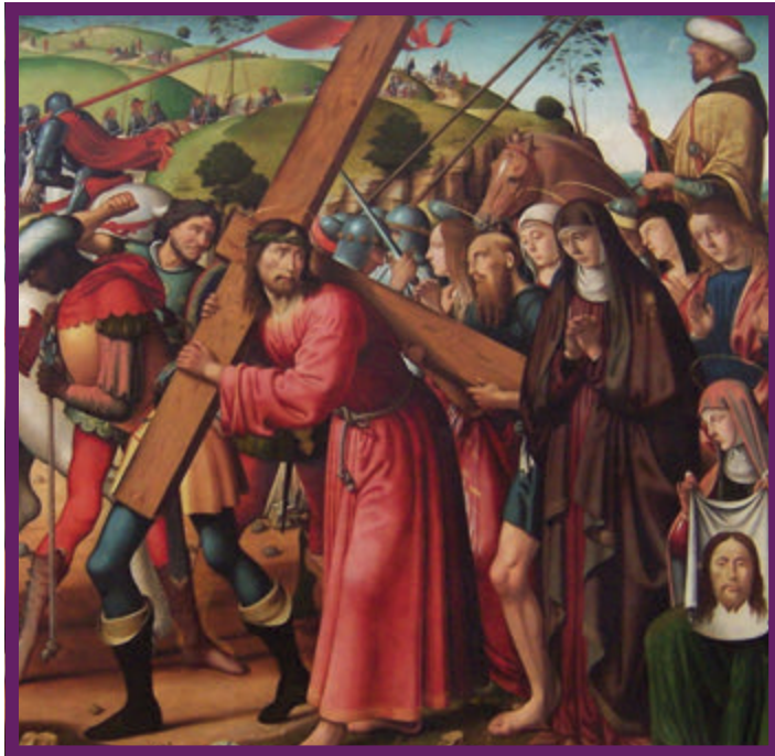
CHRIST CARRYING THE CROSS